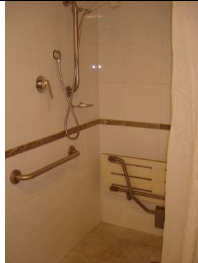
Photo: Roll-in shower, grab rail and shower seat.