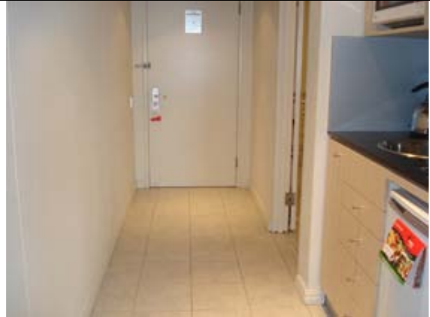
Photo: Room entry into corridor and bathroom. Kitchenette.