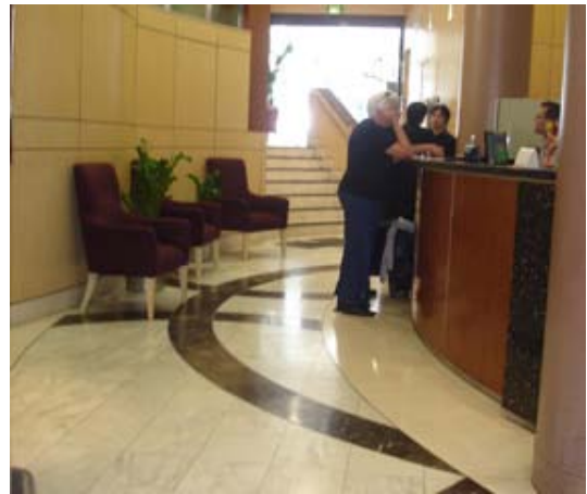
Photo: Reception desk with steps to George St entry.