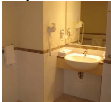
Photo: Basin with lever tap, hairdryer.