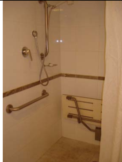
Photo: Roll-in shower, grab rail and shower seat.