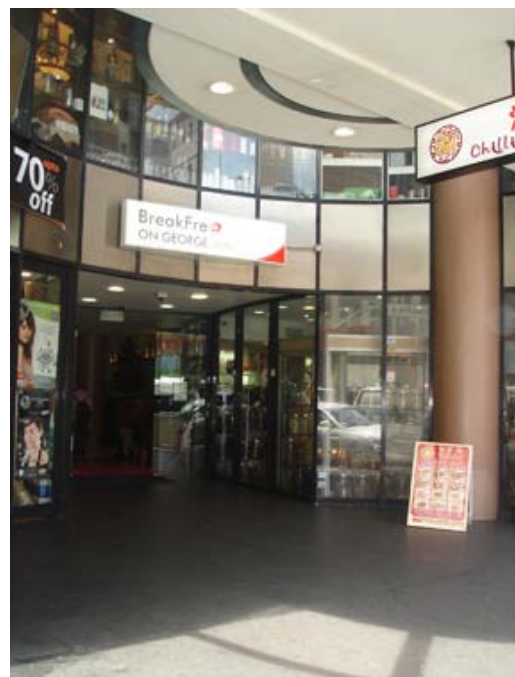
Photo: Left: steps to George St and the stair/platform lift. Right: More accessible entry from Sussex St, just around the corner.