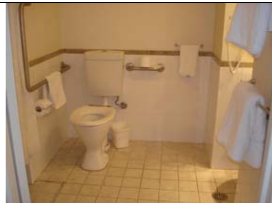
Photo: Toilet, grab rails and circulation space.