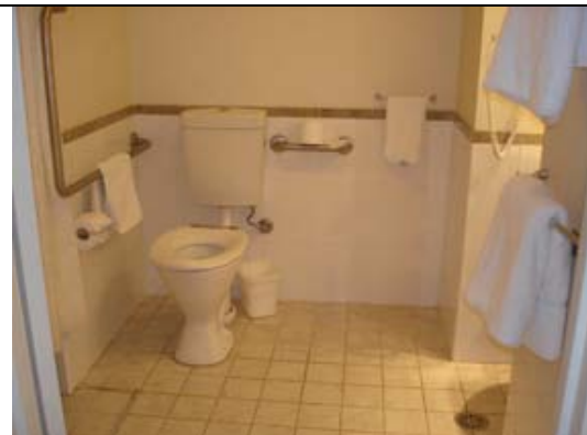
Photo: Toilet, grab rails and circulation space.