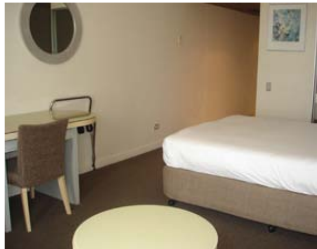
Photo: Room showing bed and furniture – the bed is on castors and can be moved to open space at the foot.