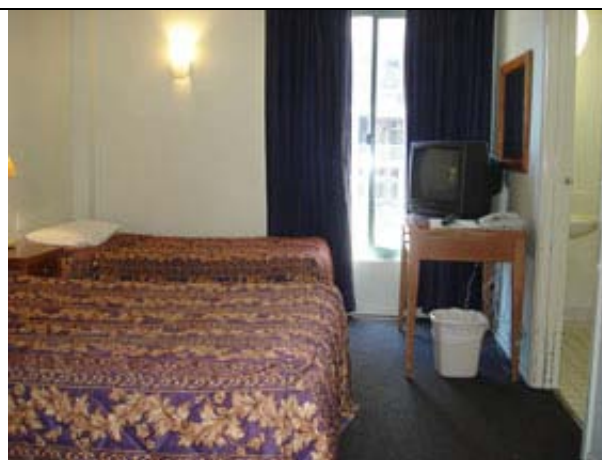
Photo: Showing compact room, circulation space and access into bathroom.