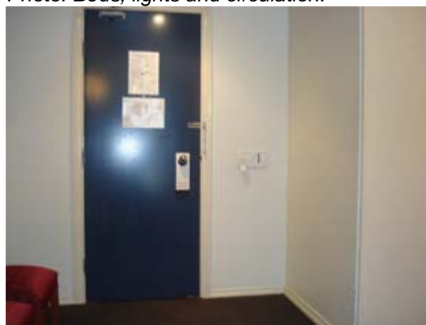
Photo: Showing entry, door knob, closer and latchside space.