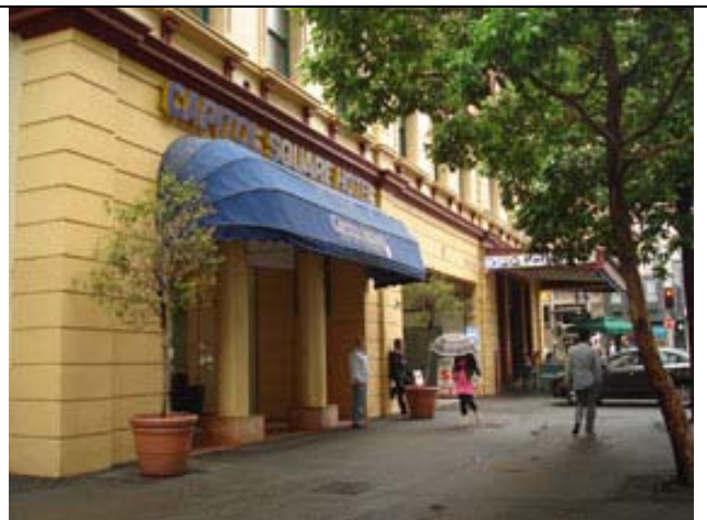
Photo: Level hotel entry and car park entry.