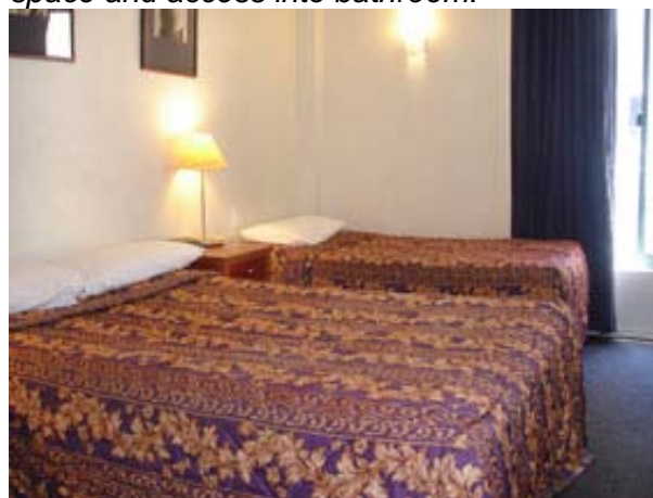
Photo: Beds, lights and circulation.