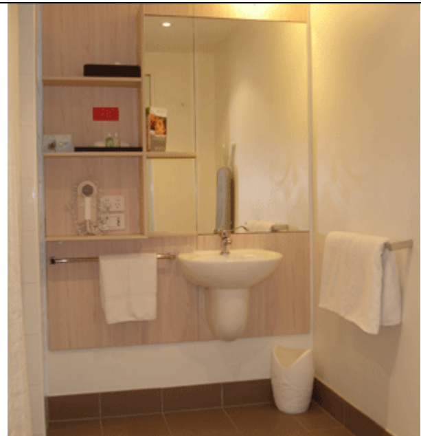
Photo: Basin from bathroom entry.