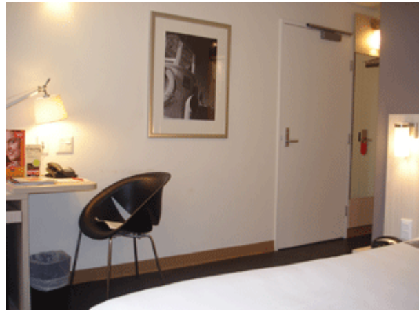
Photo: Room entry and circulation space.