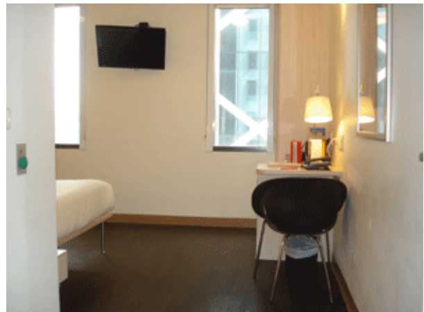
Photo: Room, bed, desk and robe.