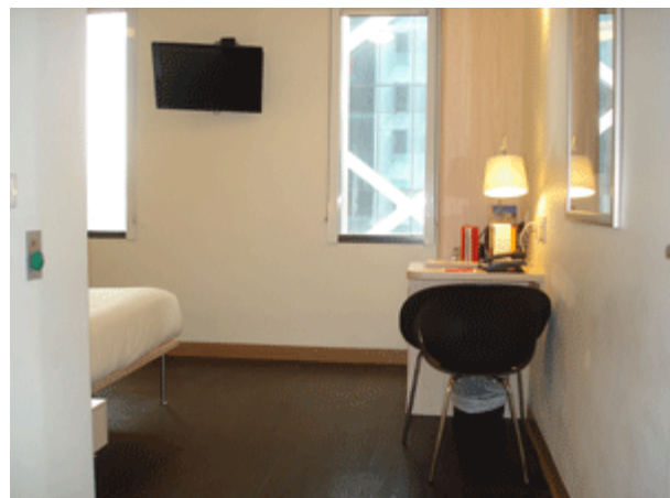
Photo: Room, bed, desk and robe.