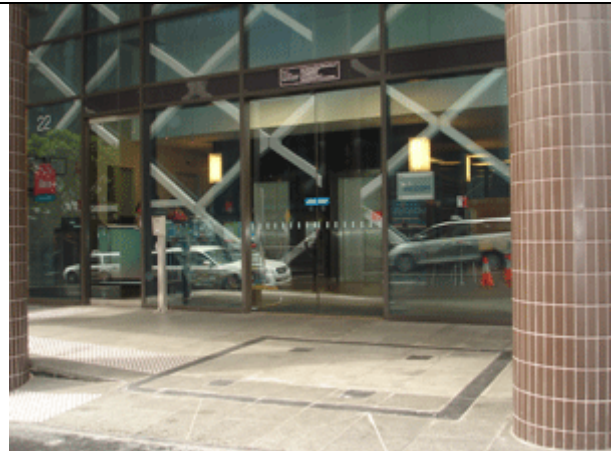
Photo: Entry through auto doors.