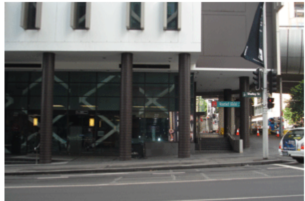
Photo: Entry from Shelley St.