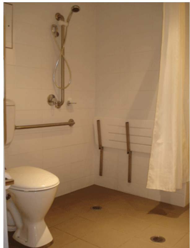
Photo: Toilet and grab rails. Roll-in shower, grab rail