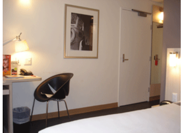
Photo: Room entry and circulation space.