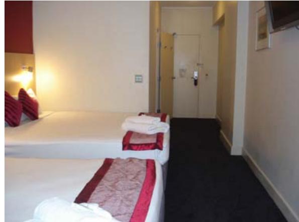
Photo: Room entry and circulation space.