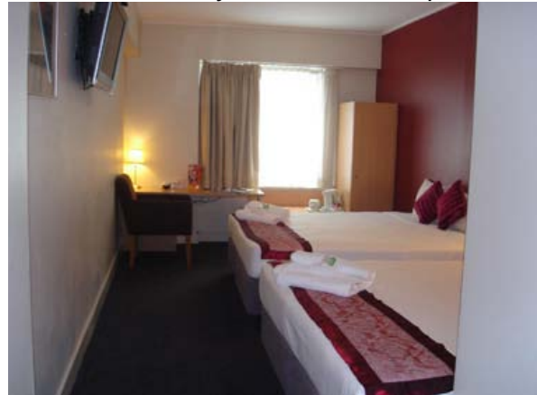
Photo: Room, desk, table and robe.