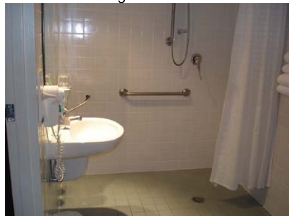
Photo: Roll-in shower, grab rail and basin.