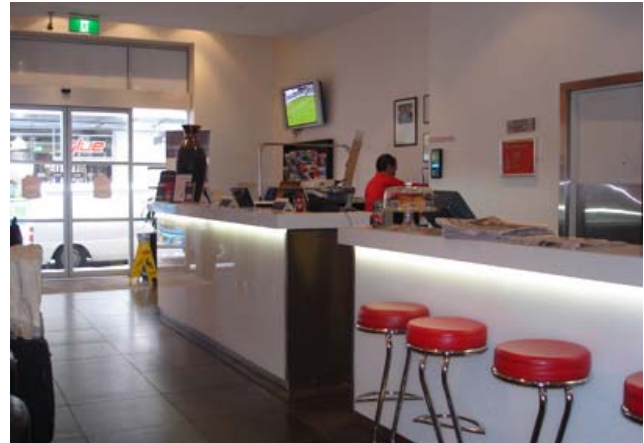
Photo: Entry, Reception and Bar.