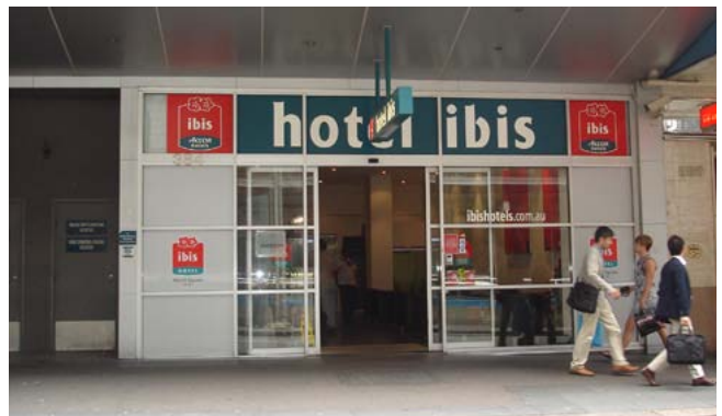
Photo: Entry from Pitt St.