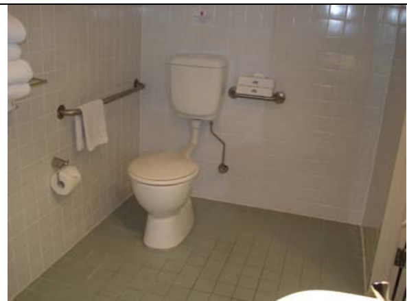
Photo: Toilet and grab rails.