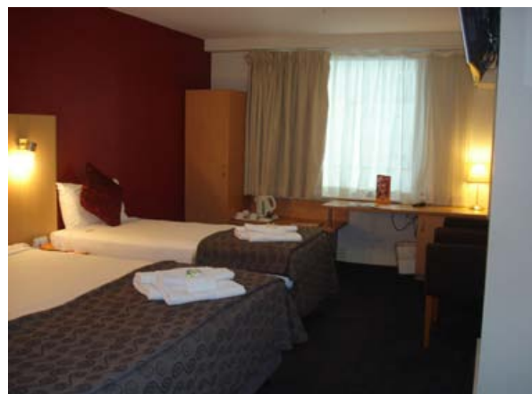
Photo: Room layout with single bed.