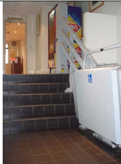
Photo: Stairlift to the restaurant area. Lift is staff operated.