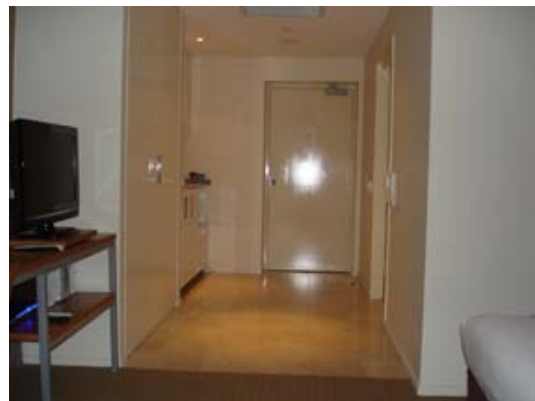
Photo: Showing end of bed, TV cabinet and room entry.