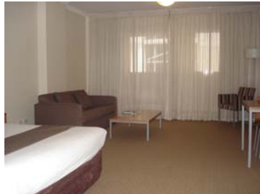
Photo: Showing room from entry, ample circulation space, desk and bed.