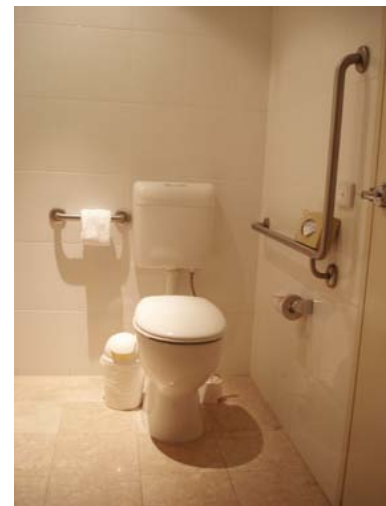
Photo: Toilet and grabrail.