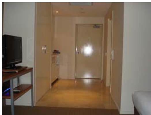
Photo: Showing end of bed, TV cabinet and room entry.