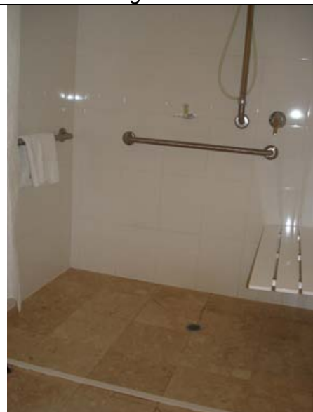
Photo: Shower area with plastic strip on the floor and fold down shower seat.