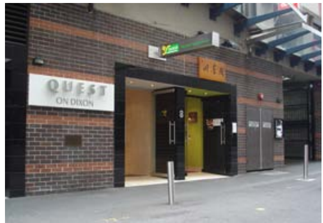
Photo: Quest on Dixon Darling Harbour, entry from Dixon St The carpark entry is just beyond the hotel entry.