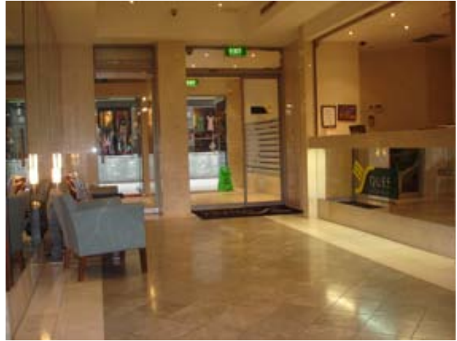
Photo: Reception Foyer.