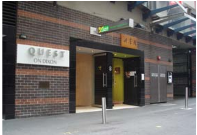
Photo: Quest on Dixon Darling Harbour, entry from Dixon St The carpark entry is just beyond the hotel entry.