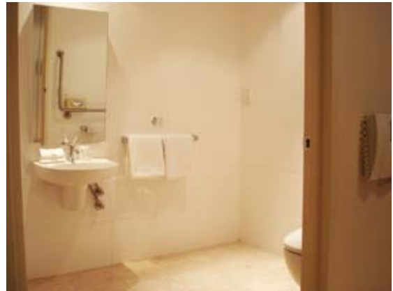
Photo: Bathroom basin area.