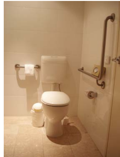
Photo: Toilet and grabrail.