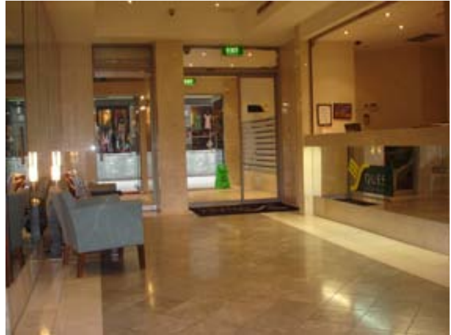
Photo: Reception Foyer.