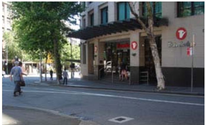
Photo: Entry from St.