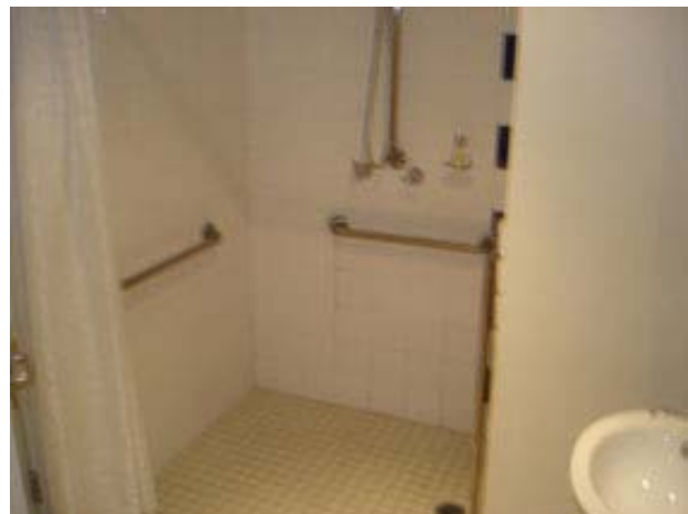
Photo: Roll-in shower, grab rail and basin.