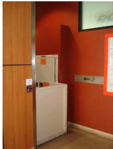
Photo: Stairlift to the restaurant area. Lift is staff operated.