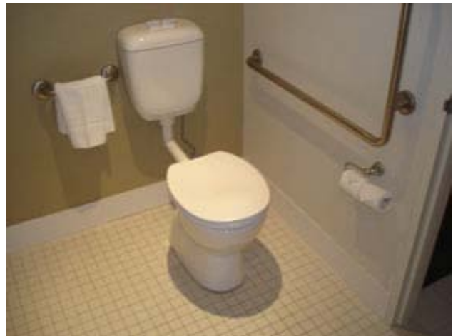
Photo: Toilet and grab rails.