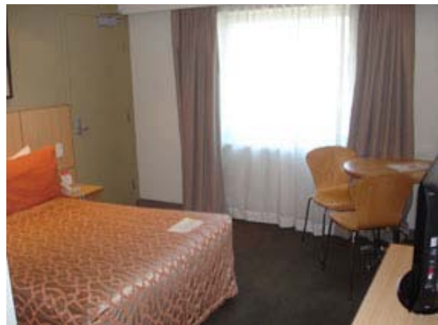
Photo: Room, desk, table and chairs.