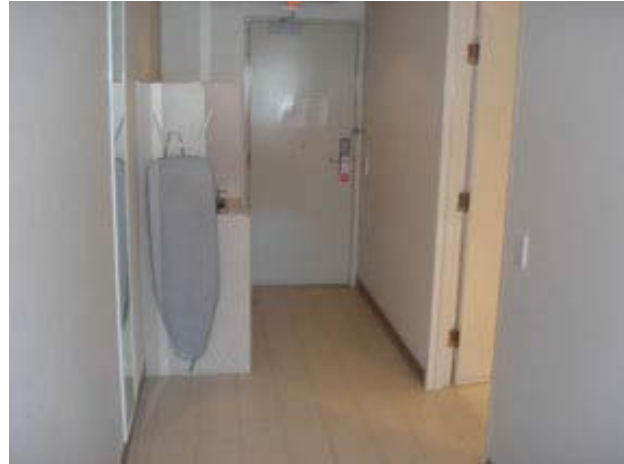
Photo: Room entry and entry to bathroom.