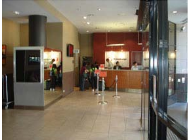
Photo: Entry and Reception.