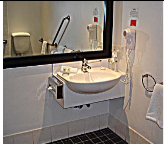
Photo: Showing basin, mirror & hair dryer