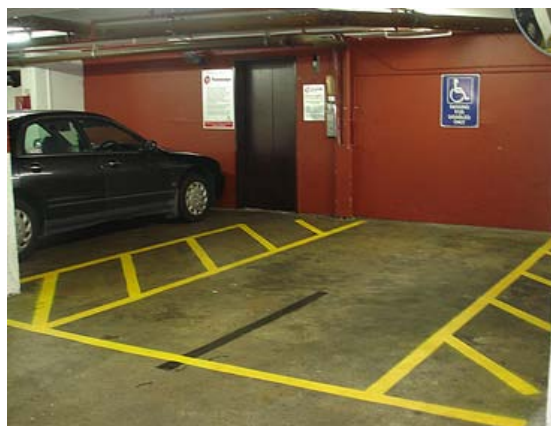
Photo: Dedicated parking space.