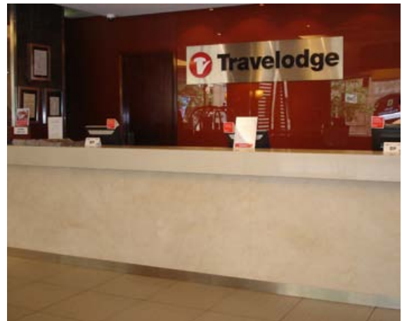
Photo: Reception desk.