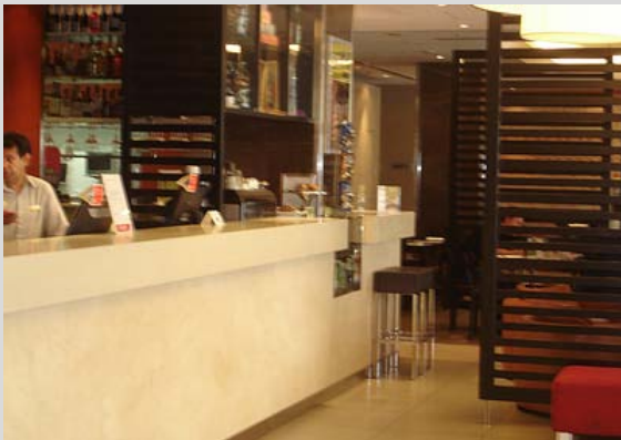
Photo: Reception desk with café.