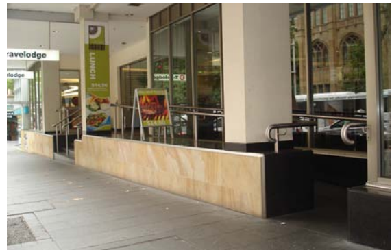
Photo: Ramped entry from York St.