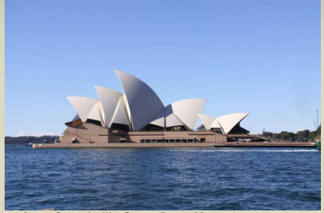
The Harbour Bridge and Opera House from Campbell's Cove