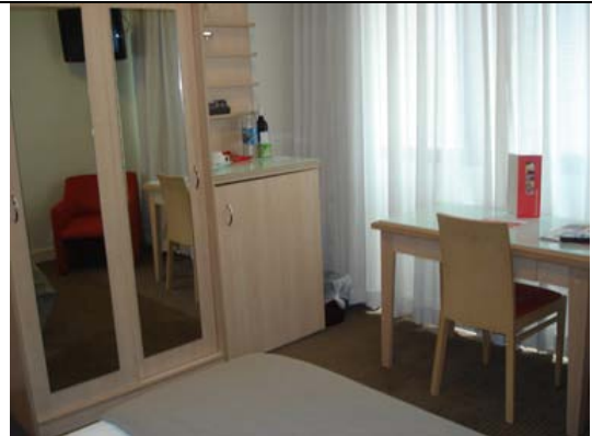
Photo: Showing wardrobe, end of bed and table & chair.