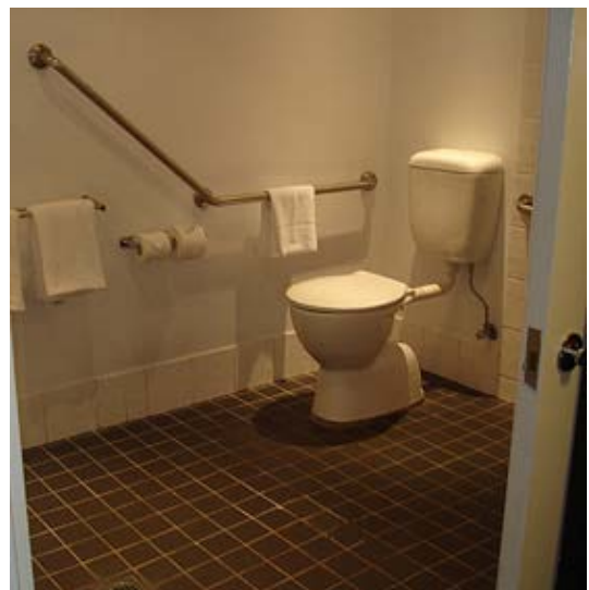
Photo: Through sliding door showing toilet & grab rail.