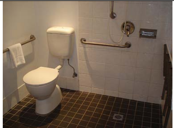
Photo: Toilet, grabrail and shower area.

The fold down shower seat measures 400mm by 900mm and is 450mm high..