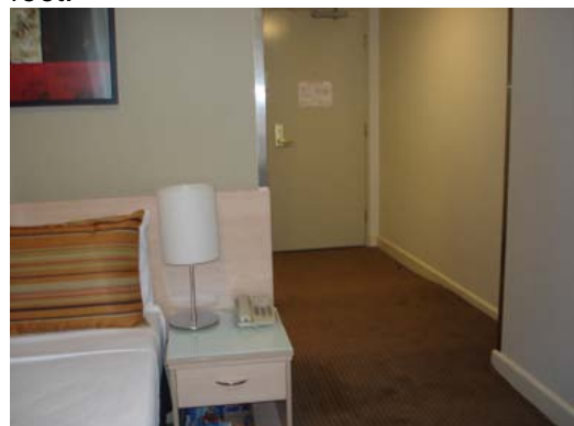
Photo: From foot of bed showing entry and graded area before bathroom entry.